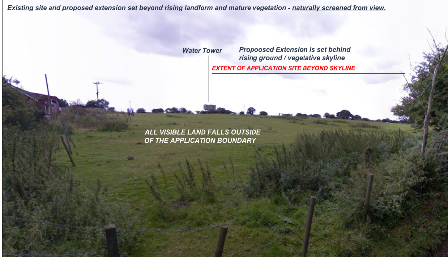
PHOTO VIEWPOINT A - EXISTING VIEW FROM FRETtenham ROAD