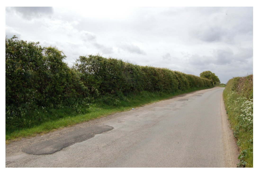
Figure 13-18 Existing tall hedge on the western side of the PEA, looking southwest along the road on western side of PEA. The hedge is 3-4m tall and blocks views from the PEA towards the Church of St Swithin.