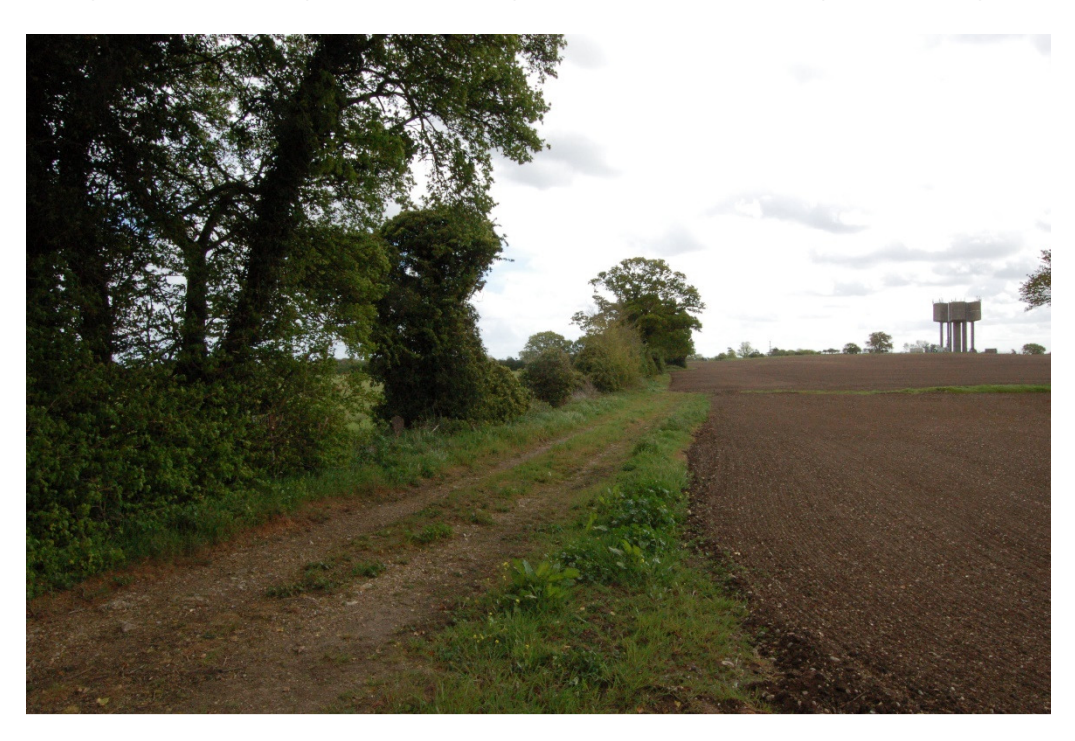
Figure 13-10 The hedge on the northern boundary of the PEA, looking east from the northwest corner of the PEA. Sections of this hedge are visible in the distance in Figure 13-8