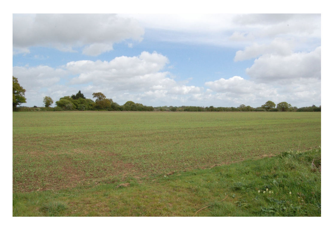
Figure 13-9 View from outside the hedge on the northwest boundary of the PEA towards the southern part of the scheduled Roman camp, which is behind the full length of the hedge in the background. This hedge is visible in Figure 13-7 and in the foreground of Figure 13-8