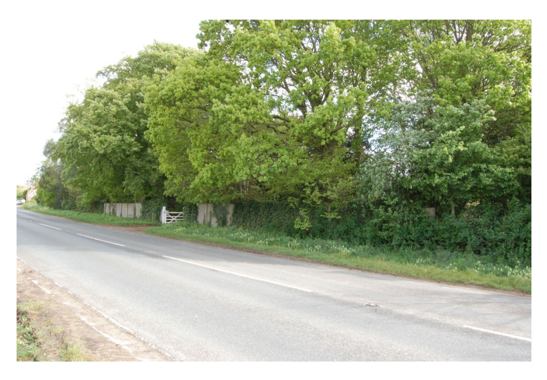
Figure 13-11 Tall well-established trees on the western edge of the curtilage of Horstead Lodge screening views to the PEA. The road shown is the B1150.