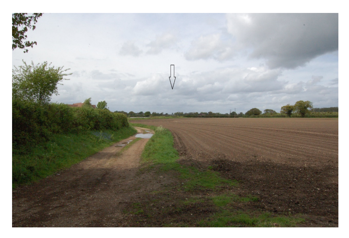
Figure 13-20 The tower of Frettenham Cornmill, from the east southeast at Stanninghall Street (arrowed). The grass and planted bund on the southwest of the current quarry is visible centre right.