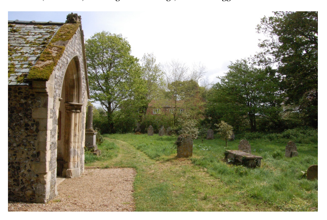
Figure 13-16 Looking east towards the PEA (not visible), from ground level, next to the south porch at the Church of St Swithin, Frettenham. Glebe Farm House is visible through the trees.