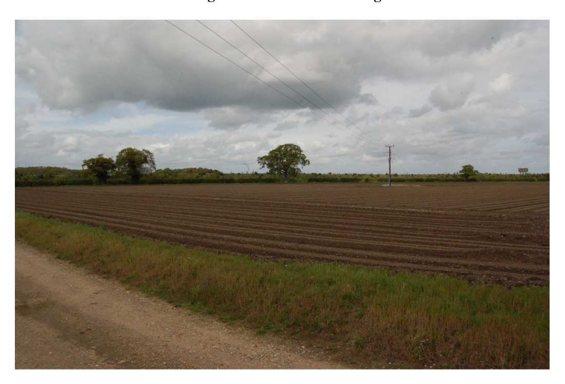
Figure 13-14 Looking northeast from a track to the northeast of Stanninghall Barn, towards the existing quarry. The grass and planted bund on the southwest of the existing quarry is visible centre background across the width of the photograph but merges well into landscape