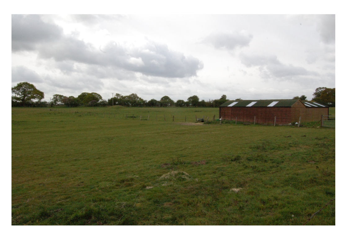
Figure 13-7 The southern part of the Roman Camp scheduled monument. Looking southwest, from the minor road that passes through the monument, towards the PEA which is not visible