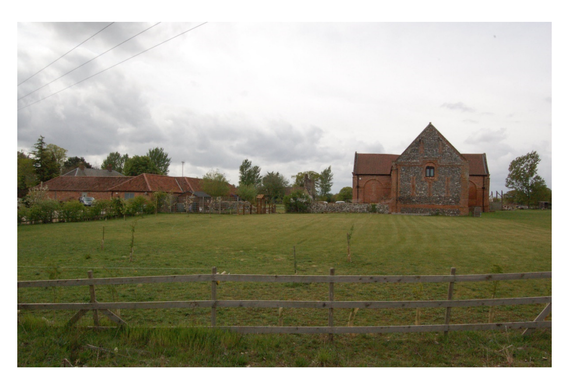
Figure 13-13 Looking west southwest at Stanninghall Farm Barn (right), from a track to the northeast. Other farm buildings and the roof of Stanninghall Farm House are on the left.