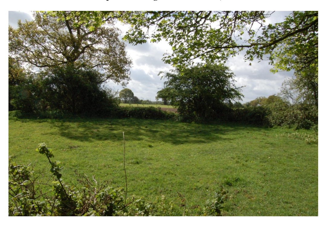
Figure 13-8 Looking south towards the northern part of the PEA from the southwestern corner of the southern part of the Roman Camp scheduled monument. The PEA is beyond the second/distant hedge and movement of machinery may be visible where there are gaps in both hedges