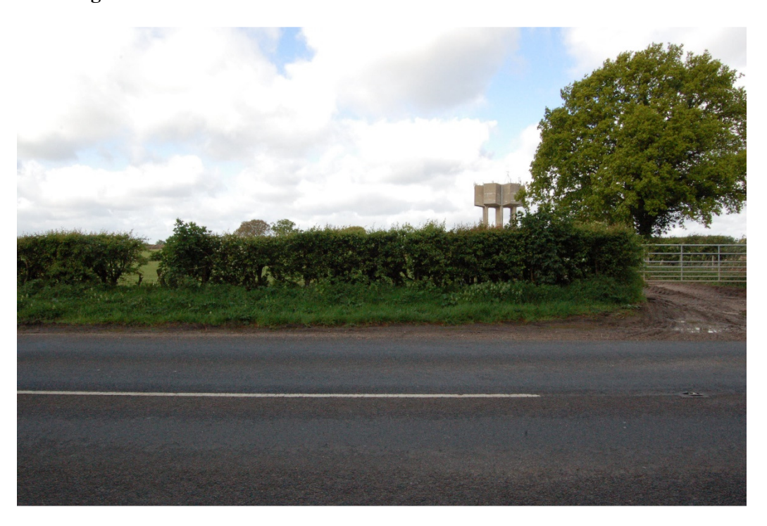
Figure 13-12 Looking westwards from where the entrance drive to Horstead Lodge meets the B1150. The PEA is in the distance, beyond the grass field concealed by the hedge.