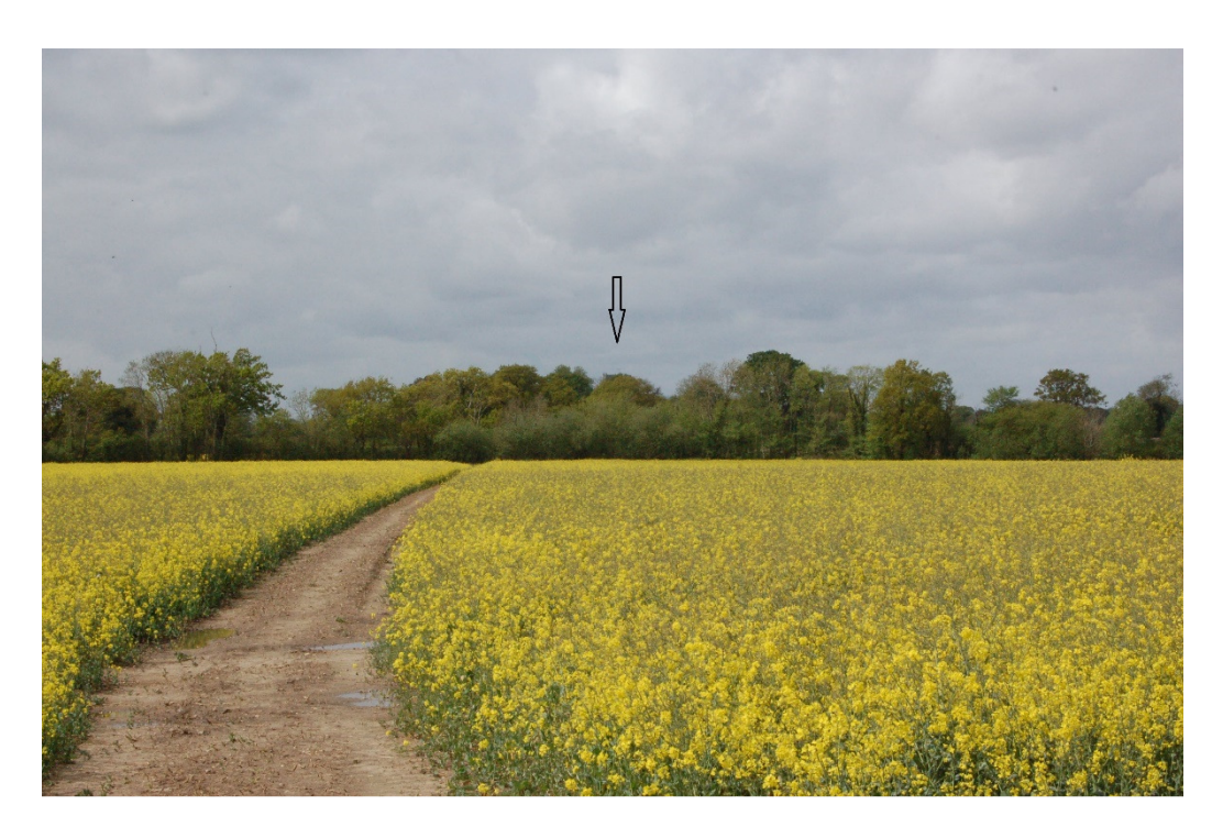
Figure 13-17 View from the road on the western side of the PEA, looking west along a footpath towards the Church of St Swithin, Frettenham. The top of the church tower is just visible above the top of trees (marked with an arrow).