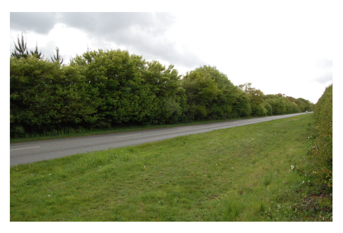
Figure 13-15 Tree belt (left) and hedge (right) beside the B1150, both of which block views from the PEA (not visible, to the right of the hedge) towards Heggatt Hall.